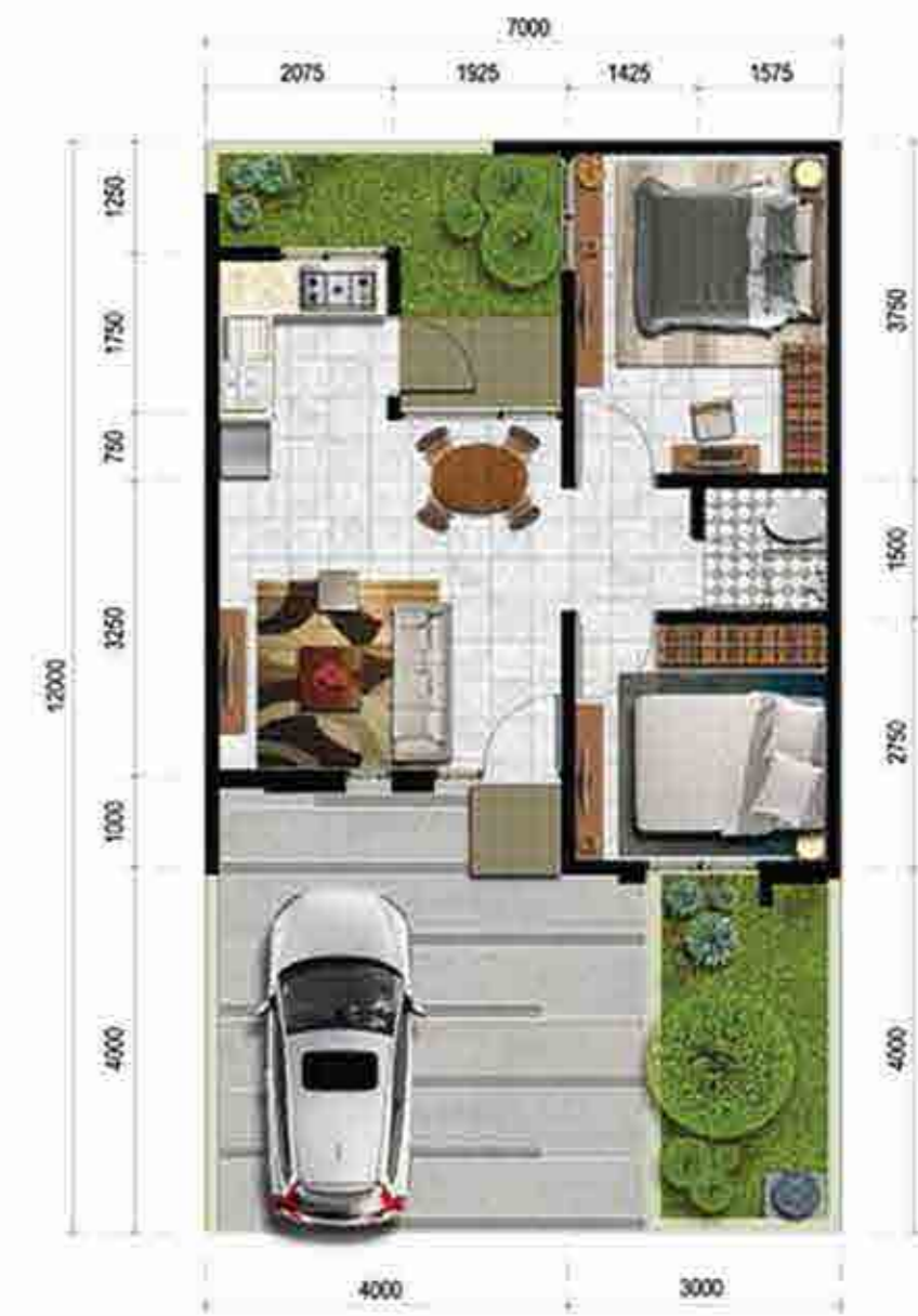
LB/LT: 45/84 (7x12)