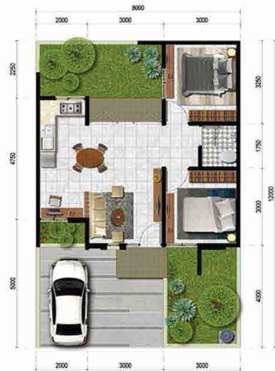
LB/LT: 51/96 (8x12)