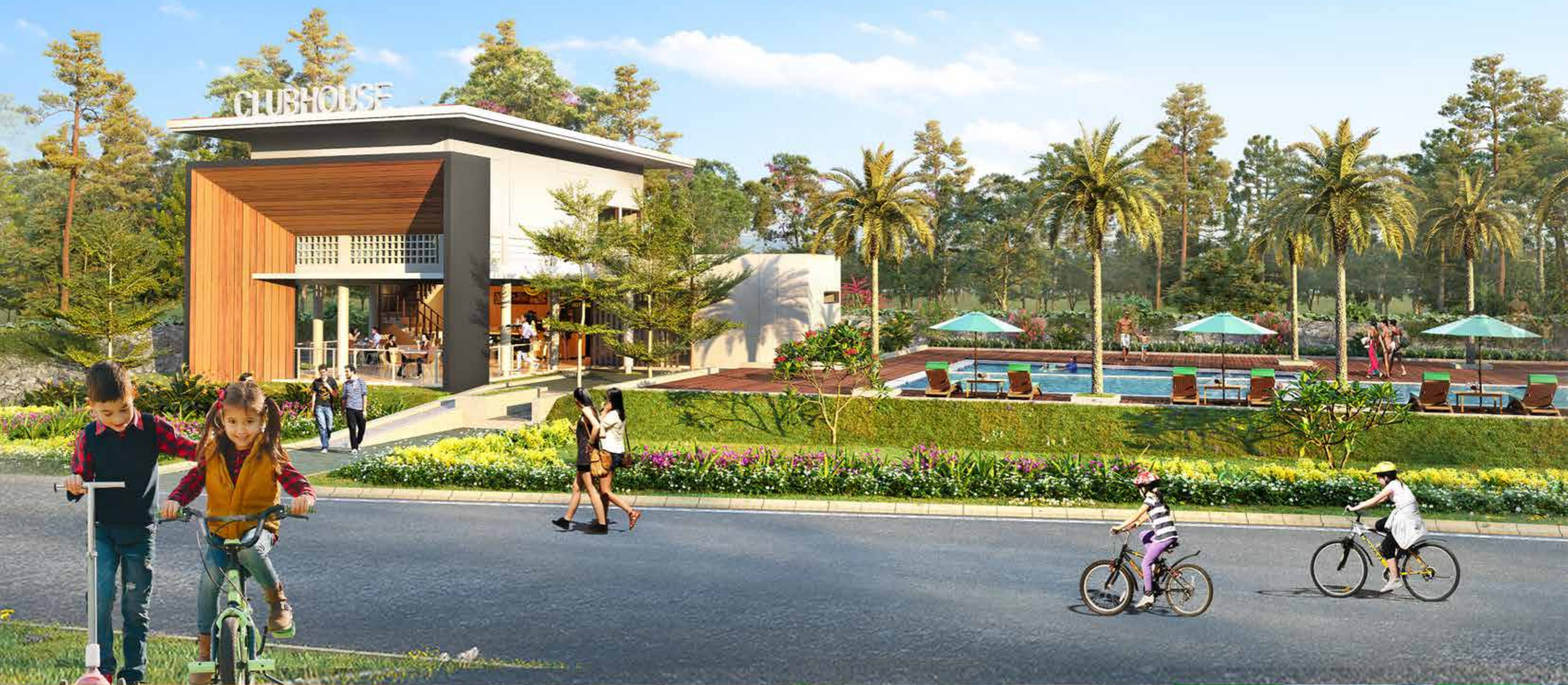
Swimming Pool - Kids Pool