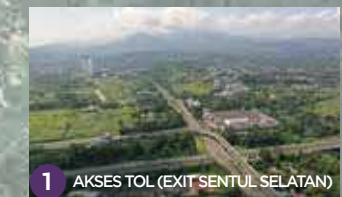
1 AKSES TOL (EXIT SENTUL SELATAN)