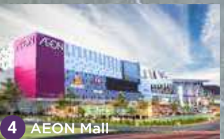
4 AEON Mall