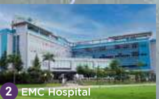
2 EMC Hospital