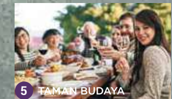
5 TAMAN BUDAYA