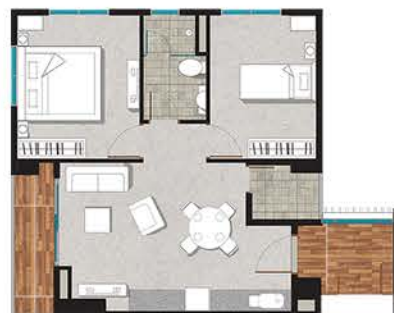
No. 06, 07, 12 & 15 - 2 Bedroom Semi-gross : 70.65 sqm