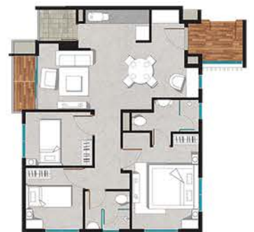
No. 05 & 11 - 3 Bedroom Semi-gross : 94.47 sqm