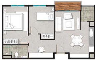
No. 02 & 08 - 2 Bedroom Semi-gross : 76.71 sqm