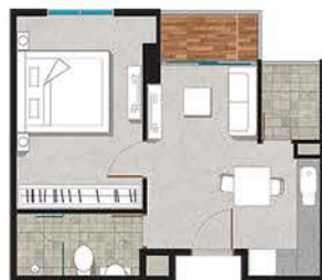
No. 01, 03, 08 & 10 - 1 Bedroom Semi-gross : 48.96 sqm