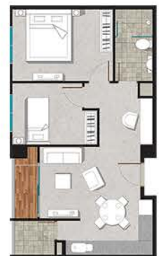
No. 05 & 11 - 2 Bedroom Semi-gross : 69.50 sqm