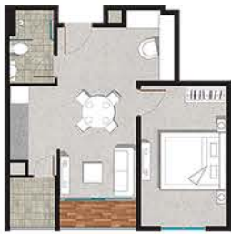
No. 07 - 1 Bedroom Semi-gross : 58.68 sqm