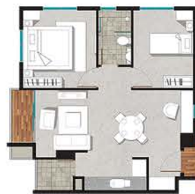
No. 06 & 10 - 2 Bedroom Semi-gross : 79.23 sqm