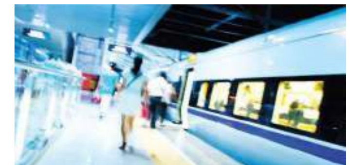
FUTURE LRT STATION SIRKUIT SENTUL