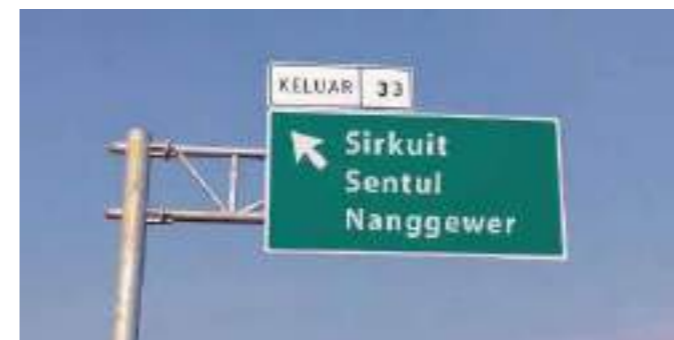
DIRECT ACCESS TO TOLL

Connecting You to the Places That Matter Most