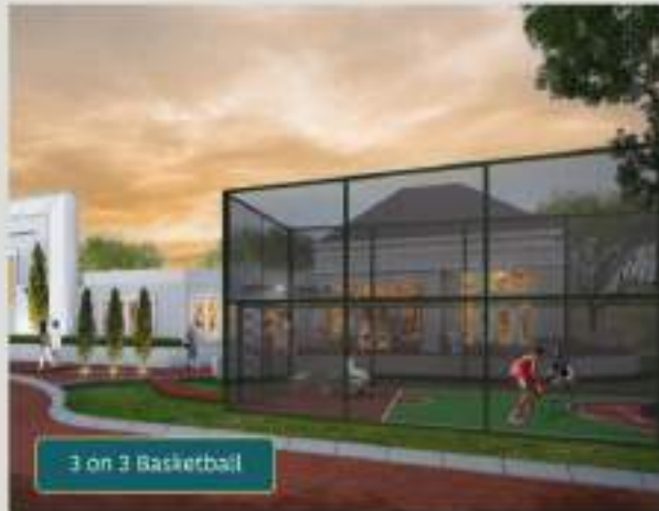
3 on 3 Basketball