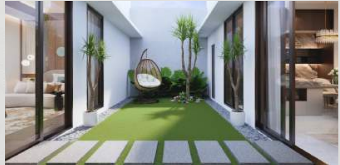
Captivating Inner Court