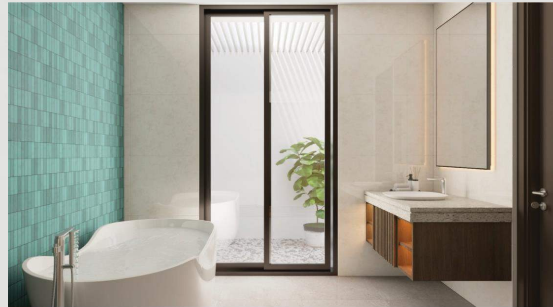
Semi Open-Air Bathroom in Master Bedroom