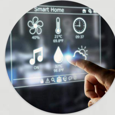
Smart Home System