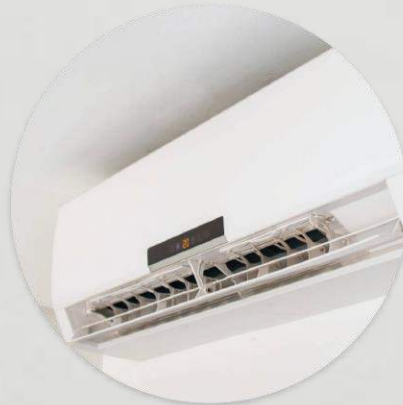
Air Conditioner in Every Bedroom, 1 st & 2 nd Floor Living Room