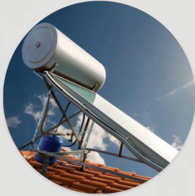
Solar Water Heater