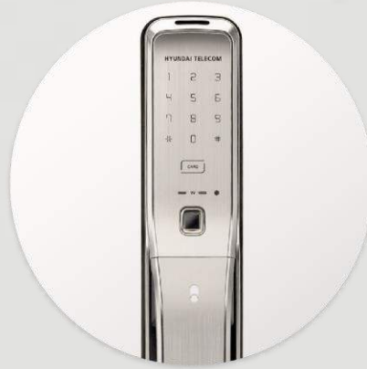
Smart Door Lock with Camera