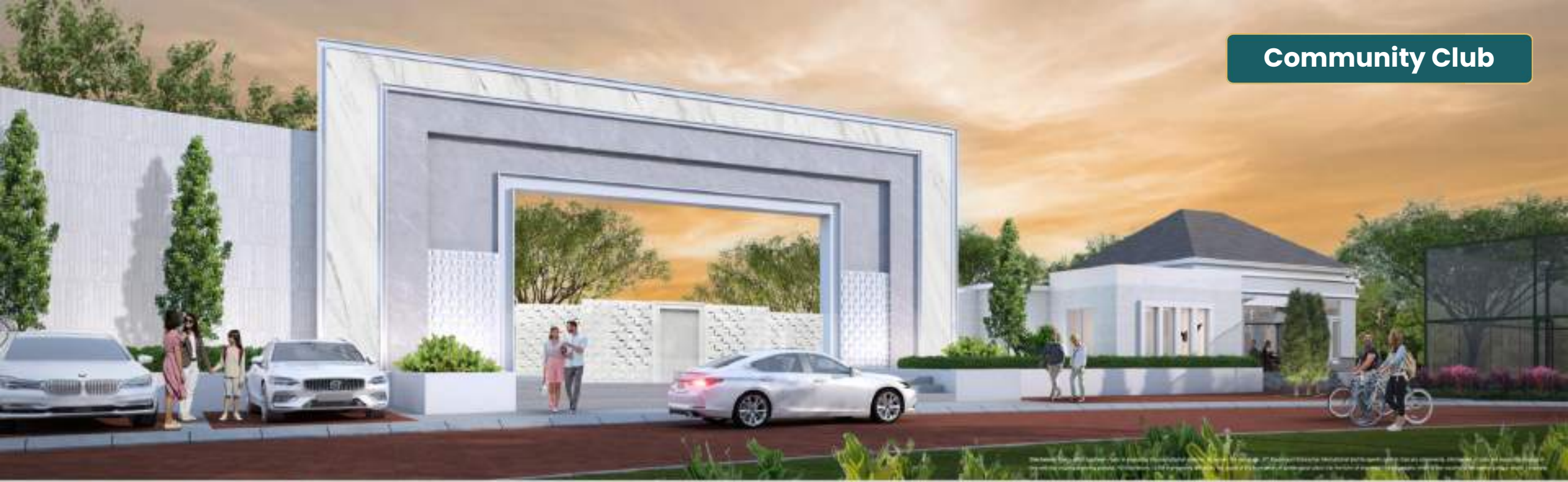
Community Club Gate