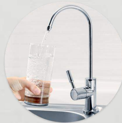
Potable Water System